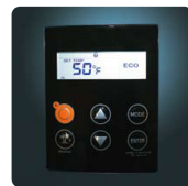
Intelligent Control System